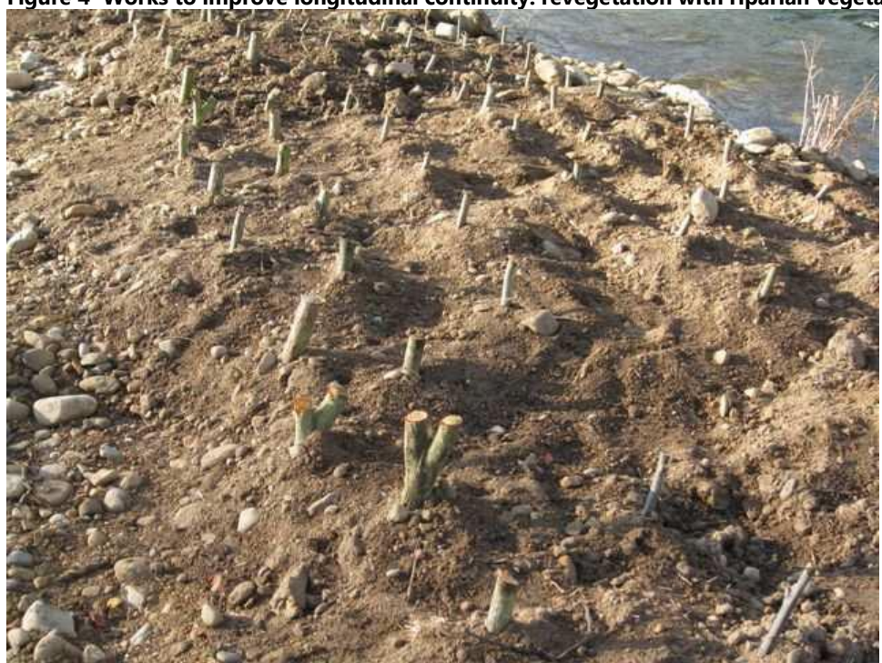
Figure 4 Works to improve longitudinal continuity: revegetation with riparian vegetation